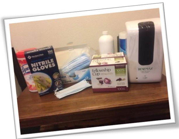
Preparing for Phase I of Regathering at the Church facility.

To learn more about the Green Chalice Program, which operates through Disciples Home Missions, please visit https://www.discipleshomemissions.org/missions-advocacy/green-chalice/